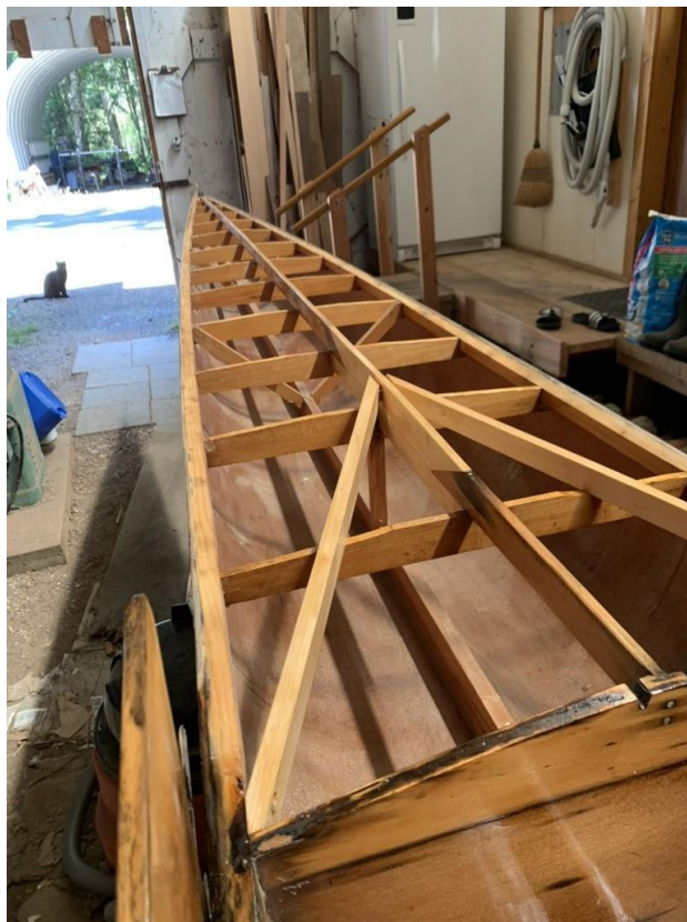
Bow Deck Structure