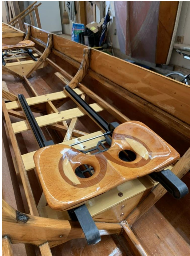
Seat rails and Seats Installed