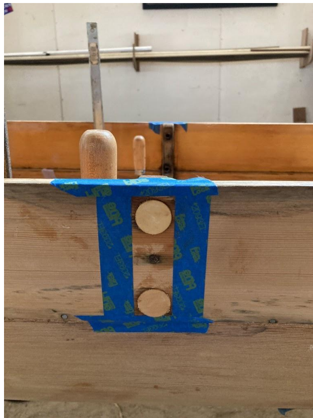
Rigger Mounting Plugs