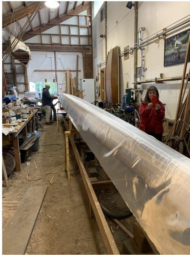
Preparing to Apply Varnish to Fiberglass