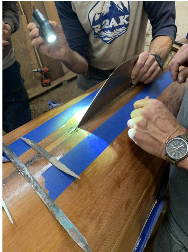
Fitting of the Fin