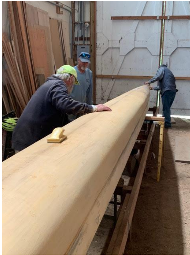
Sanding Outer Hull