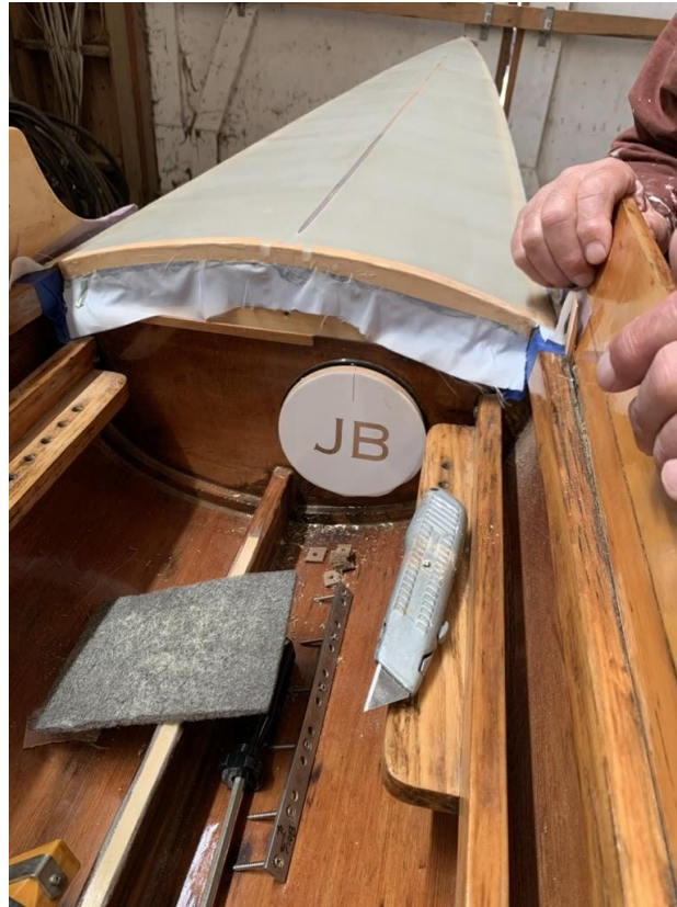
Custom Inspection/Drying Portal