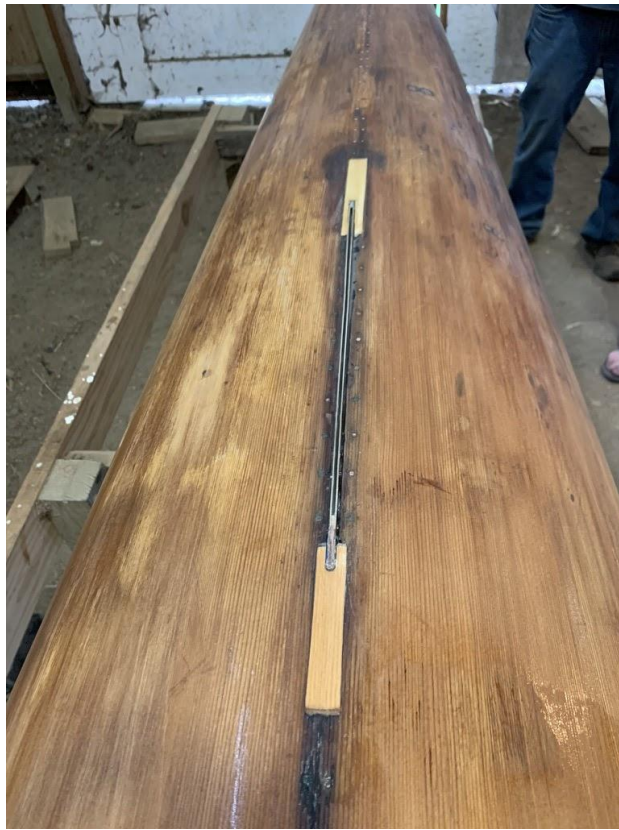
Repaired Fin Box