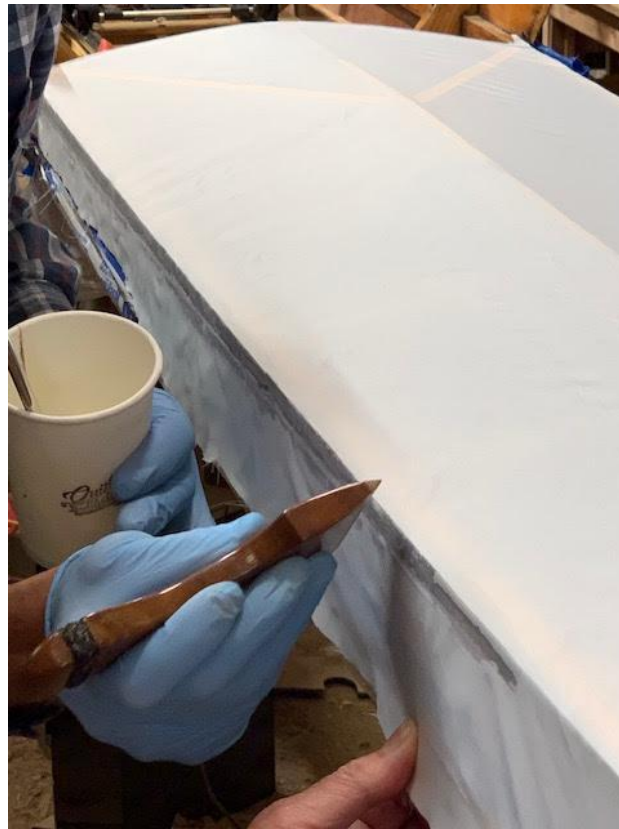
Burnishing Bow Deck