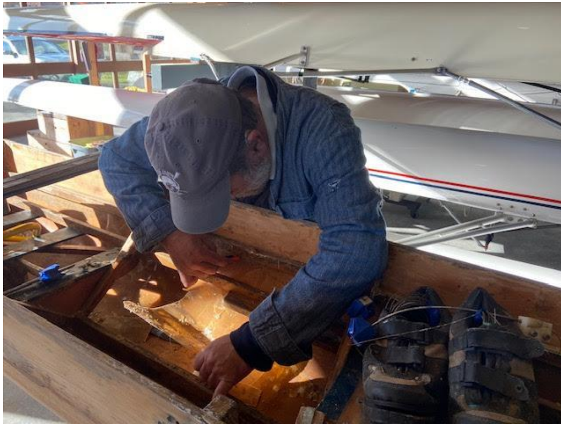
Removal of Inner Hull Coating