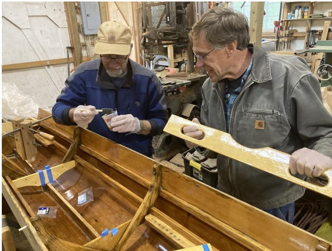
Attaching Interior Handholds