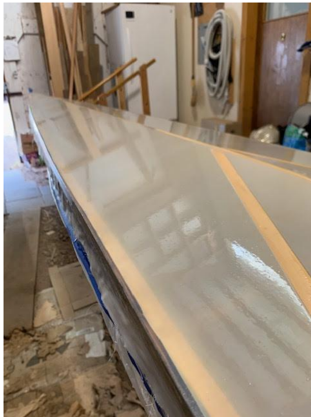
Varnished Bow Deck