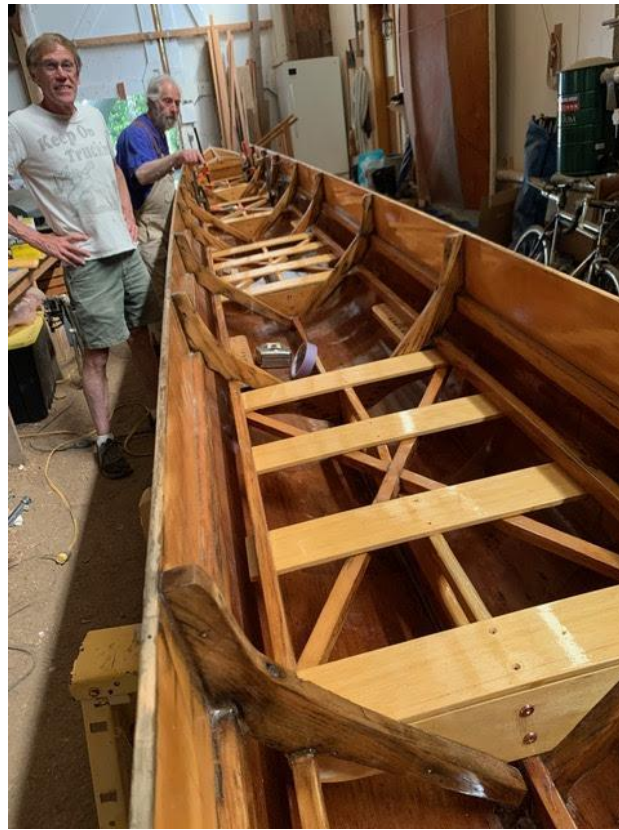
Internal Support Structure