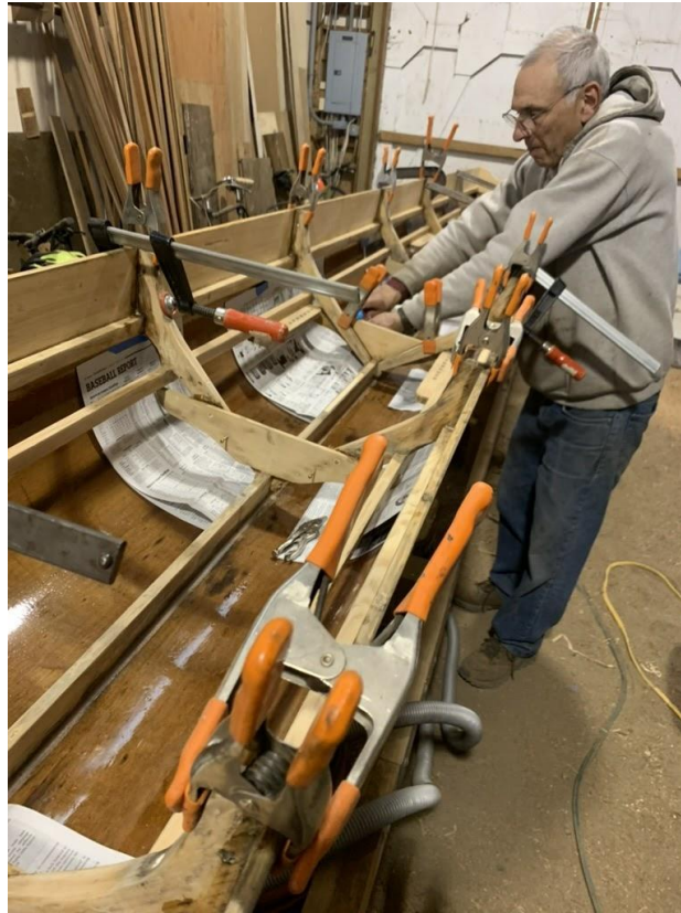
Reconstruction of Interior Support Structure