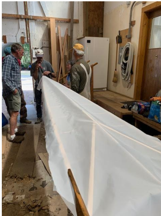
Placing Dacron for Bow Deck