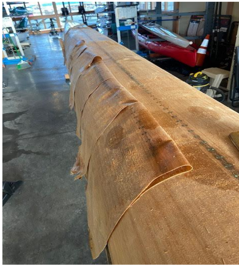
Removal of Fiberglass from Hull