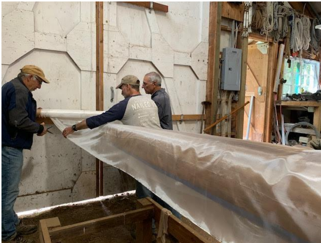
Applying Fiberglass to Outer Hull