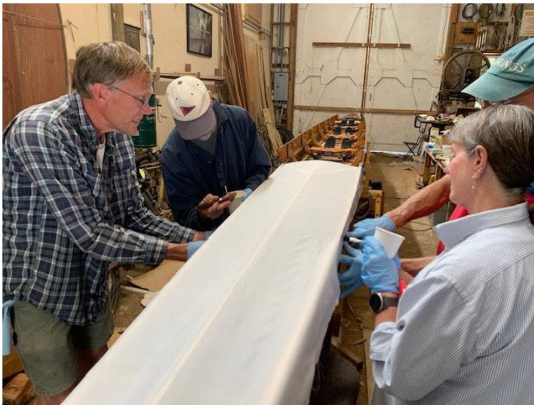
Burnishing Stern Deck