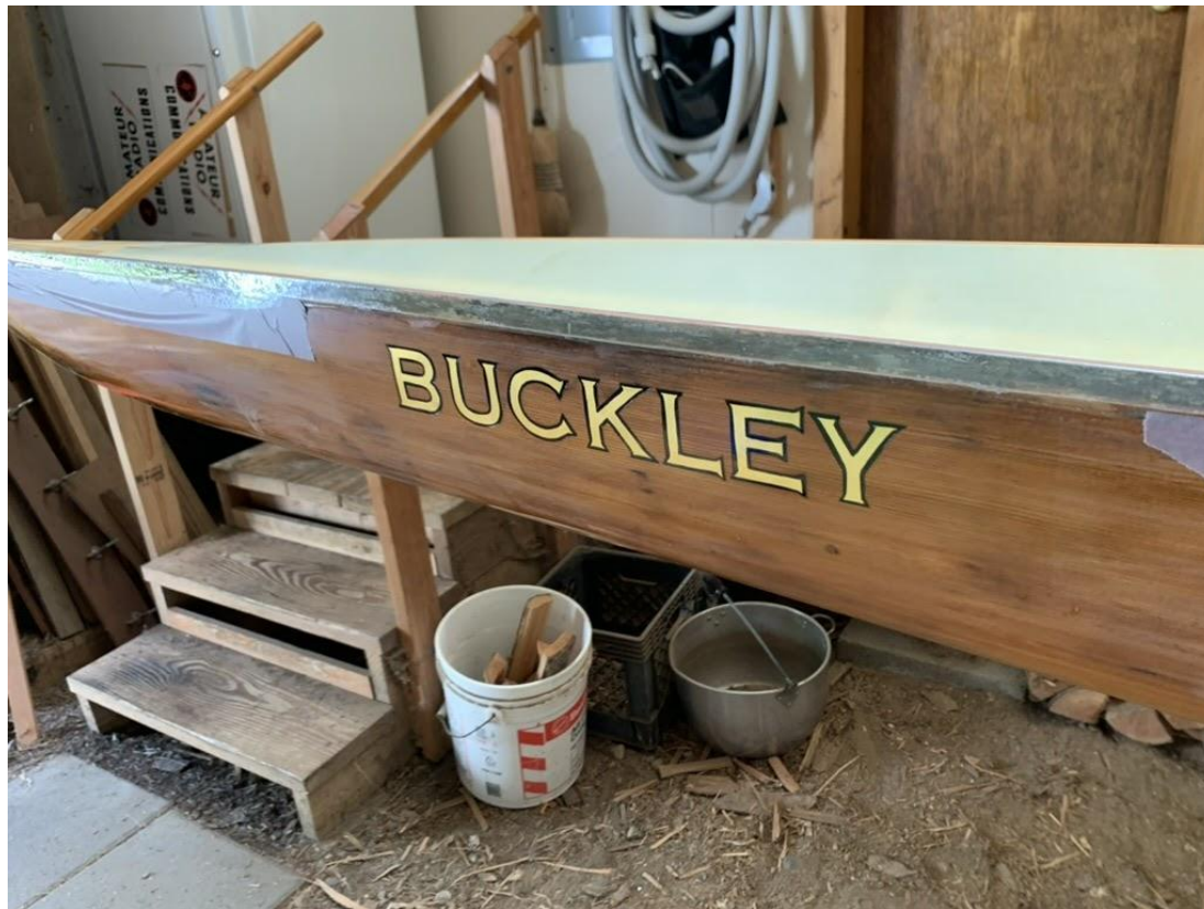
Naming Restored Boat in Honor of Jim Buckley