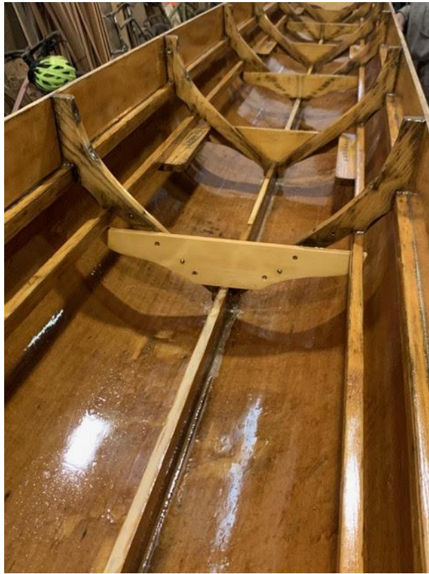
Refinished Inner Hull