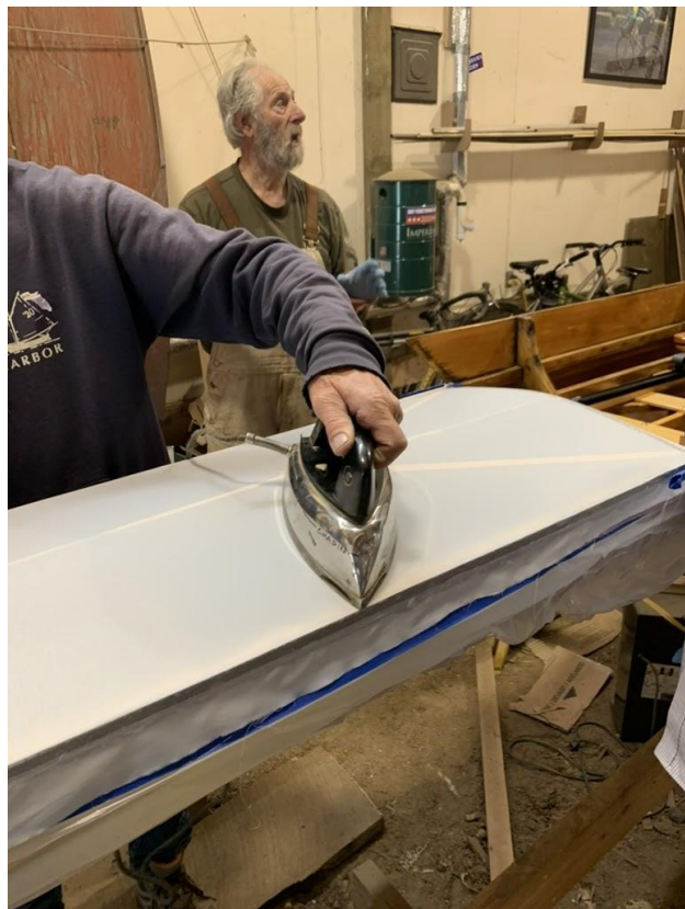
Ironing Dacron Deck