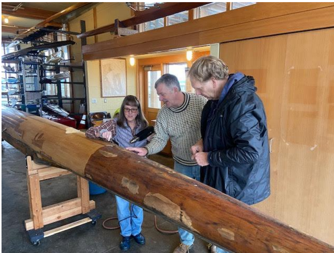
Removal of Hull Coating