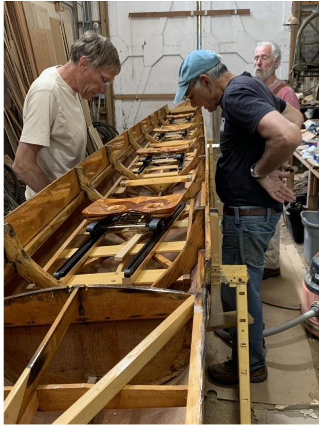
Installation of Seat Rails and Seats