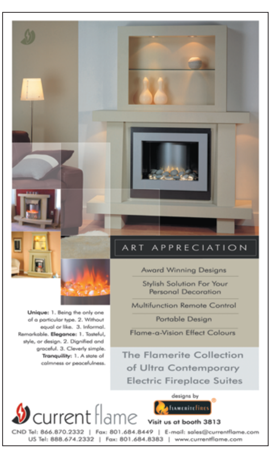
Circle Reader Service No. 033

BLANCHARD: "I don't know if we can expect this in five years, but