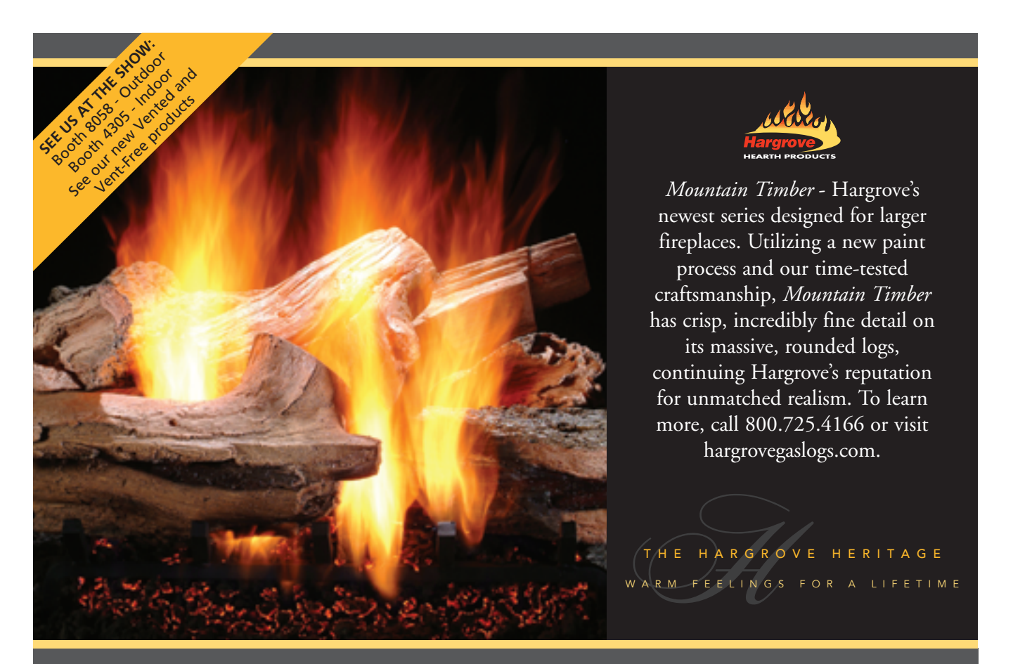
Circle Reader Service No. 016

OMNI: I know this is a difficult question, but what do you see as the best path forward for the hearth industry on this issue?